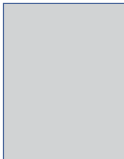
Honorable Harris Fawell Member of Congress (Ret.)